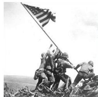
Raising the Flag on Iwo Jima is a historic photo taken in 1945 on Iwo Jima during WWII.

This one year course focuses on the social, political, and economic developments of United States history. Students will learn about the United States from its early colonial era to the present day. ALL students are required to take a mid-term exam in January and the New York State United States History and Government Regents Examination in June.